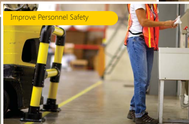
Improve Personnel Safety