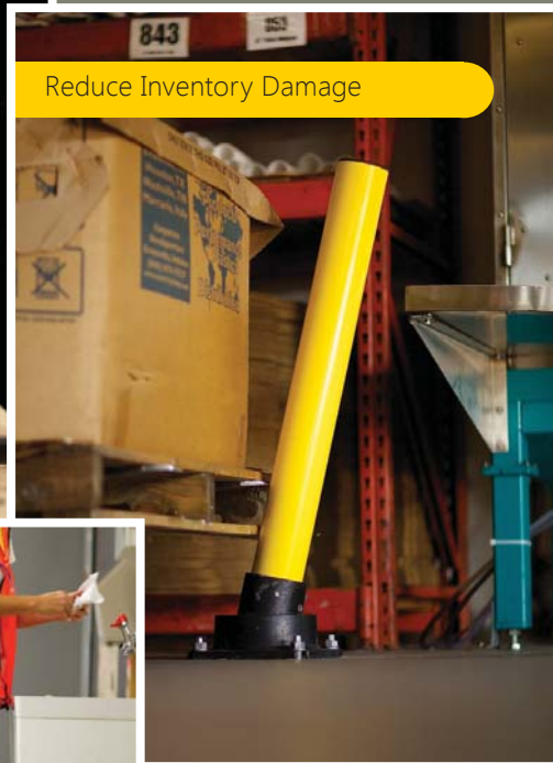
Reduce Inventory Damage